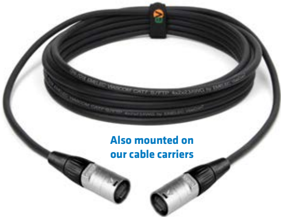
Also mounted on our cable carriers