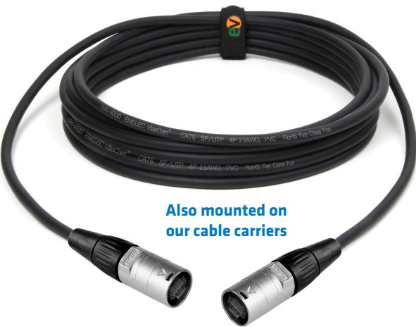
Also mounted on our cable carriers